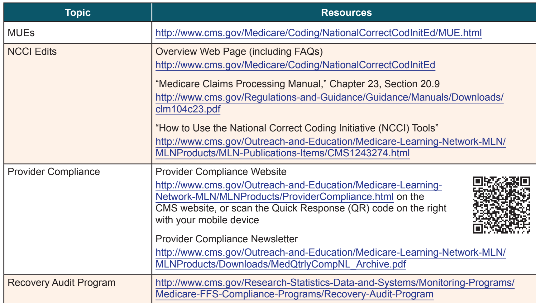
Table 5. Resources (cont.)